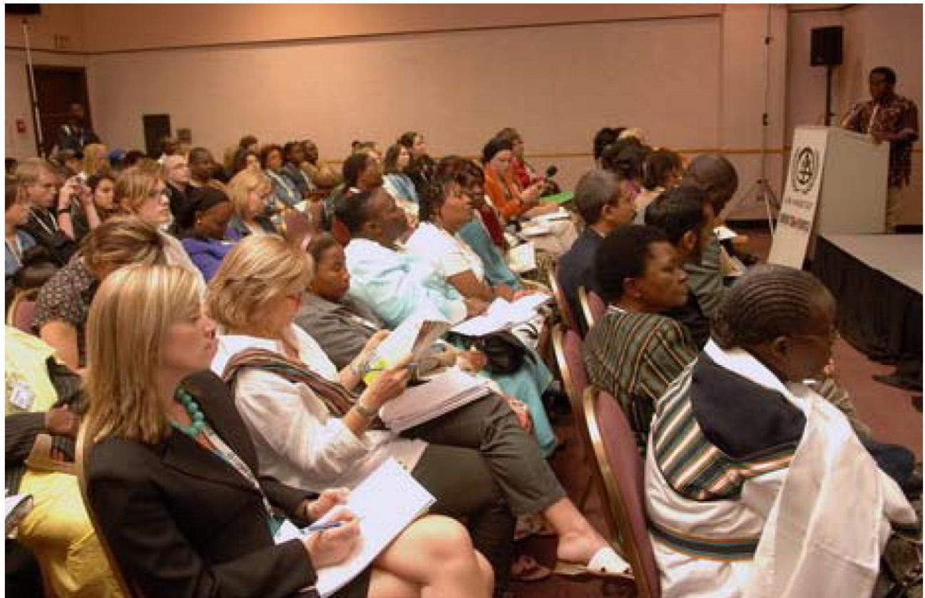
World Urban Forum, Vancouver 2006.