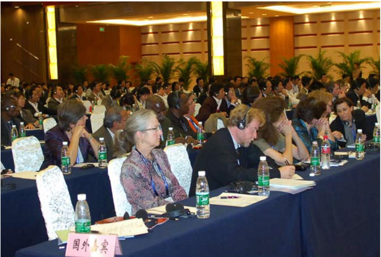
World Urban Forum, Vancouver 2006.