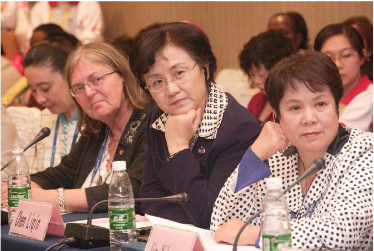
Roundtable participants at the Nanjing Forum.