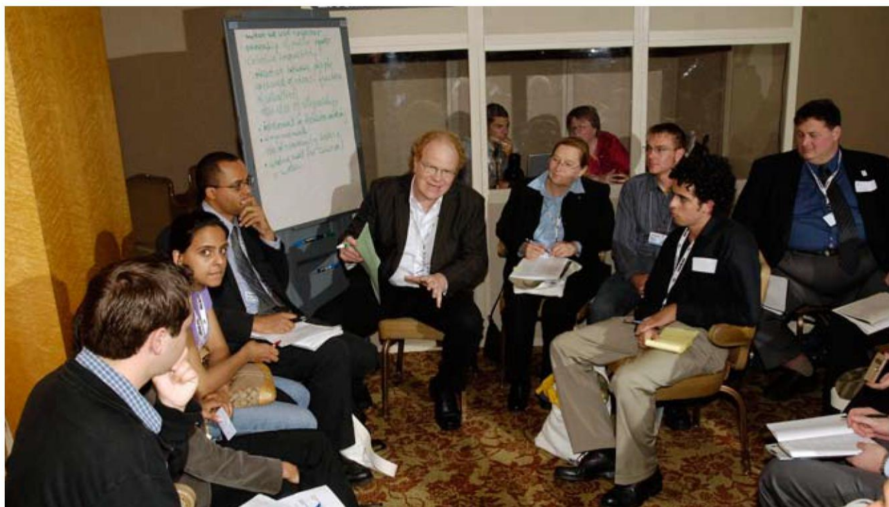
Networking at the Vancouver Forum 2006.