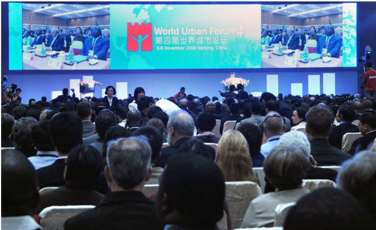
Opening ceremony, Nanjing Forum 2008.