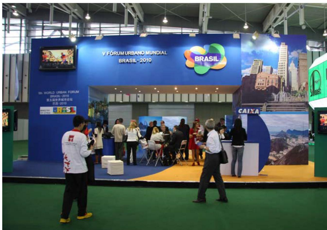
Brasil at the Nanjing Forum Exhibition 2008.