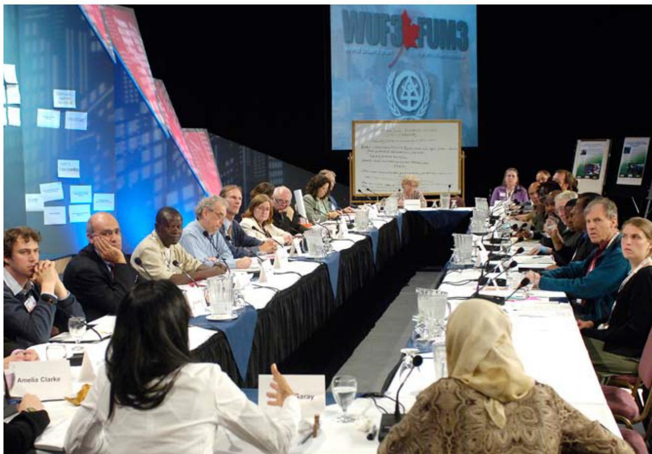
Roundtable at the Vancouver Forum 2006.