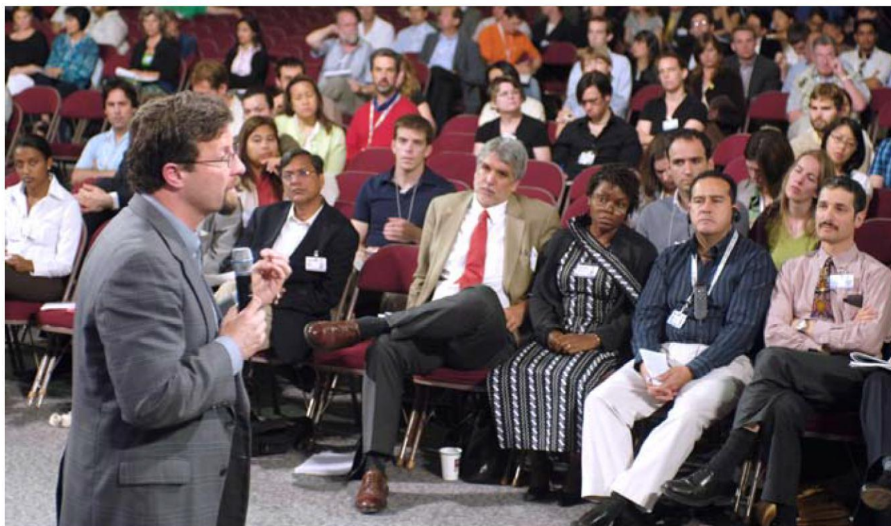
Dialogue at the Vancouver Forum 2006.