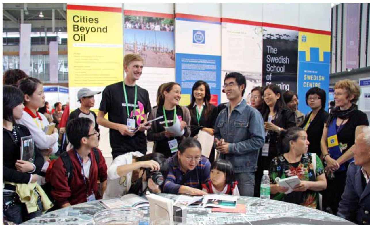
World Urban Forum, Nanjing 2008.