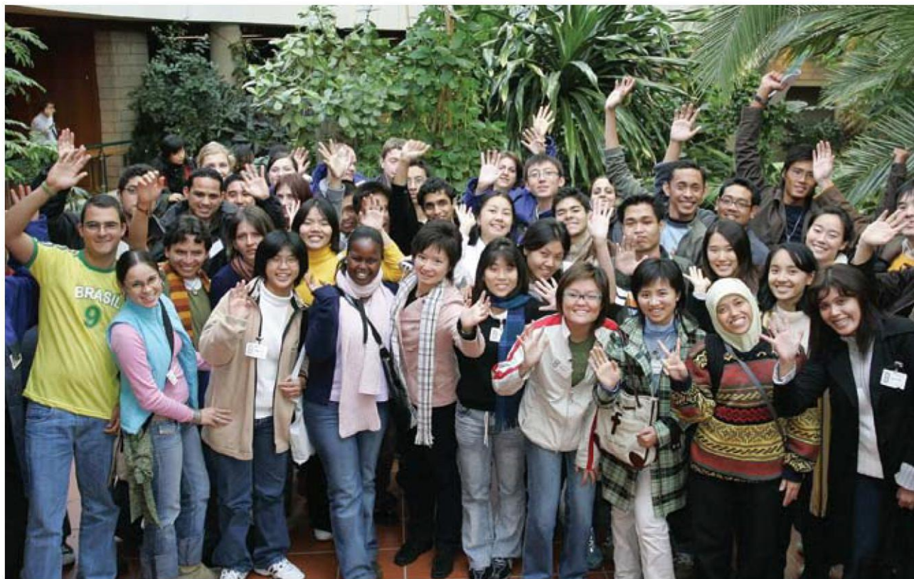
UN-HABITAT Youth Event.